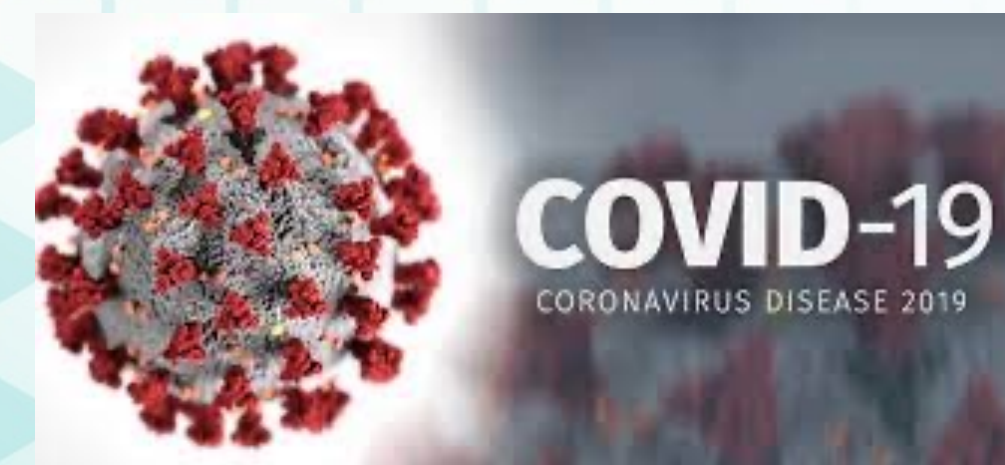
Major supplier of medicines during COVID19